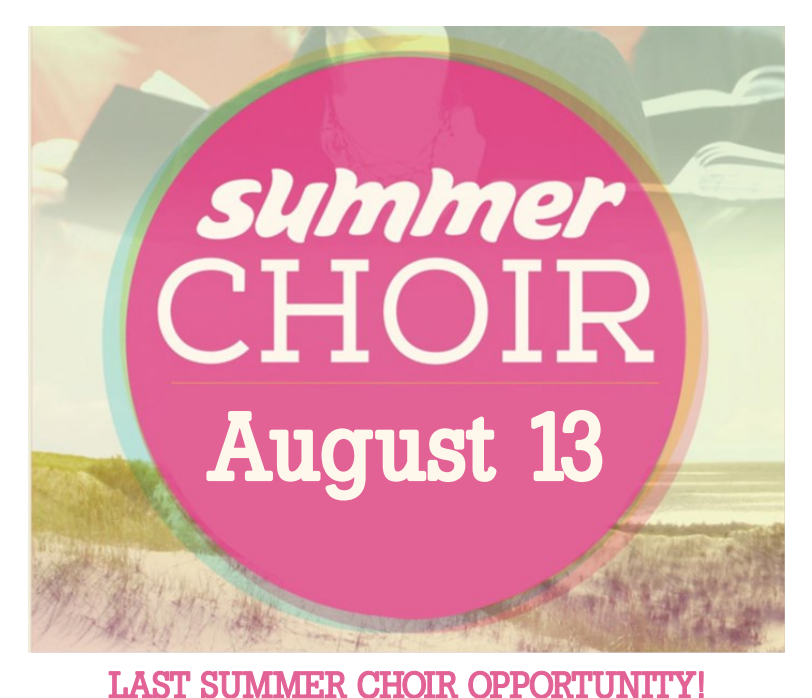
All are invited to join, arrive 9am to practice for the 9:30 & 11:00 traditional services.