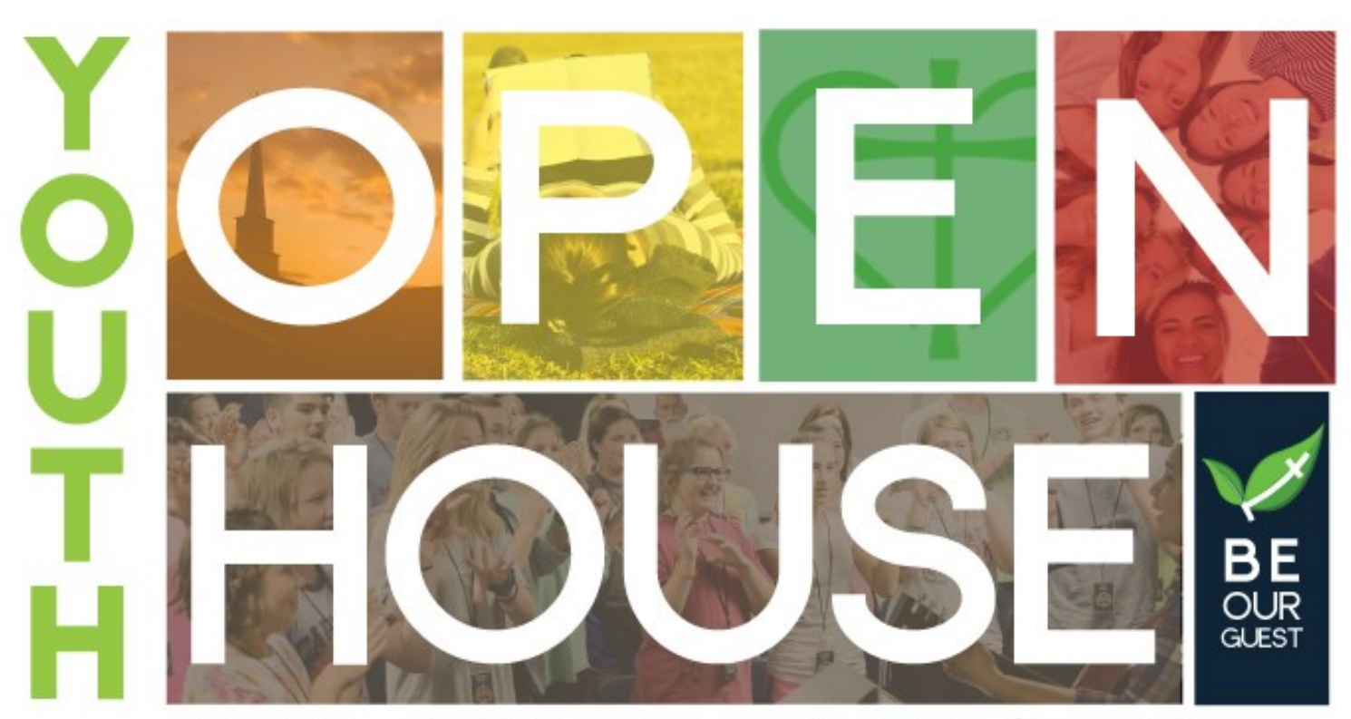
TUESDAY, AUGUST 29TH FROM 6:30-8:00PM

(13), and two of the cutest dogs on earth - Molly (terrier/maltese) and Penny (golden retriever). They love Carmel, especially the schools, Monon Trail and the roundabouts!